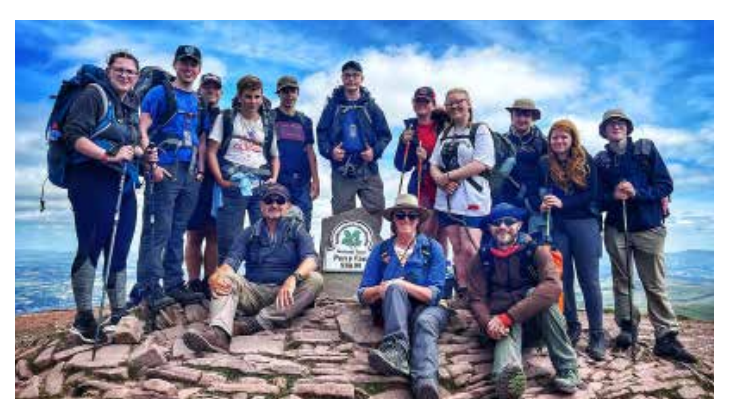
Duke of Edinburgh Award

From the age of 14, there is an amazing opportunity for students to start their journey through the Duke of Edinburgh Award Scheme. This can be continued at The Island VI Form, where dedicated DofE staff will support students through their award. The Duke of Edinburgh's Award Scheme is a charity that aims to create a world where young people can reach their full potential, whatever their circumstances.